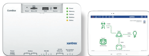
FREEDOM SW Conext Combox (809-0918)

Available telephone to network cable adapter to avoid the need to replace cables when replacing and old inverter. (#808-9010 sold separately)